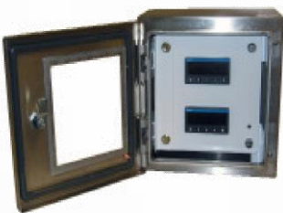
Control cabinet for AM3030(for 2 units, optionally available)